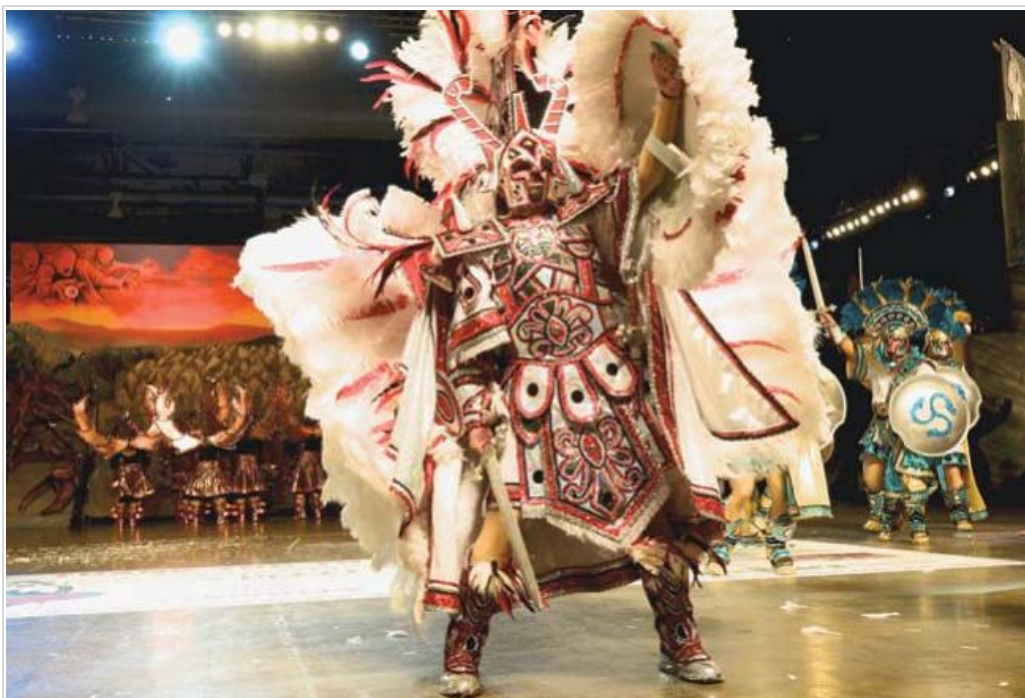
Come New Year's Day, the Mummies' Fancy Brigades will be strutting their stuff in front of a packed house of fans and judges.

Posted Nov. 23, 2011 | Comments: 4 | Add Comment